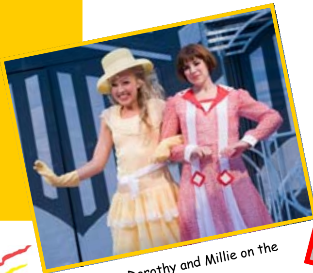
Why, it's Miss Dorothy and Millie on the Mainstage!