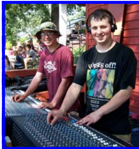
We're all ears! The Sound Crew gets ready for the show.