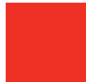
Glee Choir class, Trollwood Academy

SHOW ANNOUNCEMENT COMING SOON! We anticipate being able to make the announcement of our 2011 musical show selection within the next few weeks. Keep your eye on Trollwood's Web site and Facebook page for the news!